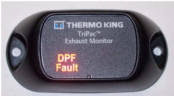
Red DPF Fault Indicator Light on Exhaust Monitor

Two types of fault codes are used: Warning and Shutdown. Refer to the Fault Code chart for more details.