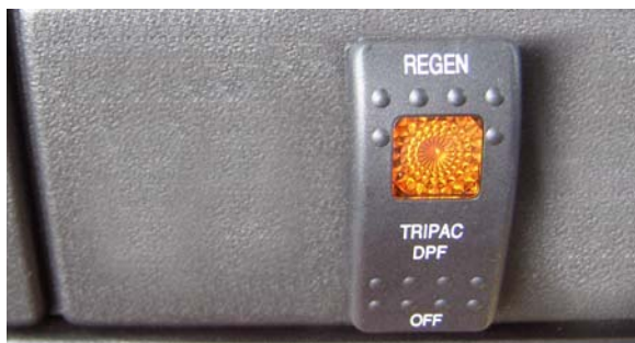
Amber Indicator Light on Regeneration Switch