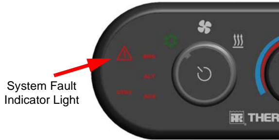
System Fault Indicator Light

The HMI System Fault indicator light will glow when the DPF on-board diagnostic system detects an abnormal operating condition indicating a SHUTDOWN code.