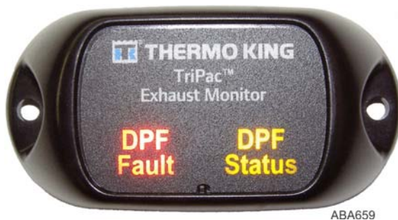
DPF Fault and DPF Status Lights on Exhaust Monitor

See System Fault Indicator and Fault Codes Section for more details.