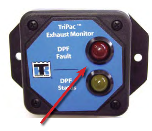
Red DPF Fault Indicator Light on Exhaust Monitor

Two types of fault codes are used: Warning and Shutdown. Refer to the Fault Code chart for more details.