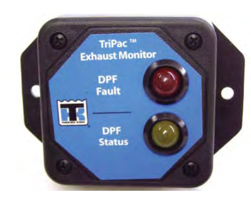
Red and Amber Indicator Lights on Exhaust Monitor

See System Fault Indicator and Fault Codes Section for more details.