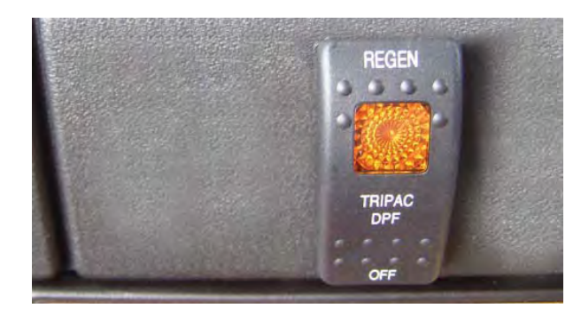
Amber Indicator Light on Regeneration Switch