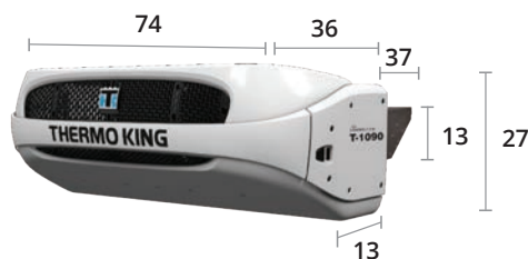
T-890, T-890 MAX, T-1090, T-1090 MAX, T-1090 SPECTRUM